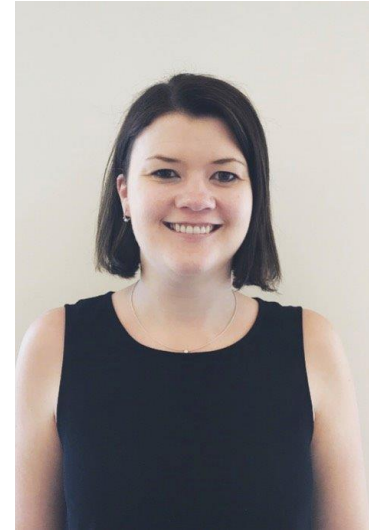
B.Sc (Hons) Occupational Therapy; AHPRA registered OT; Occupational Therapy Australia Member