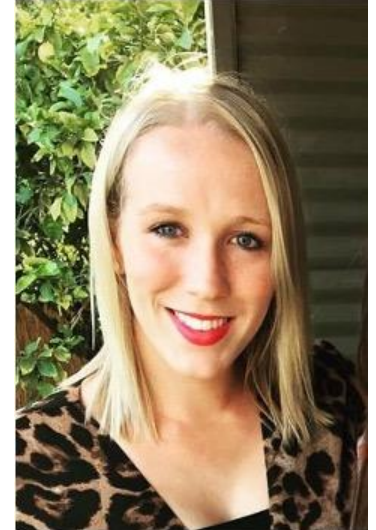
B.Hlth.Sc (Major in Psychology); M.OT; Graduate Certificate in Disability; AHPRA registered OT; Occupational Therapy Australia Member