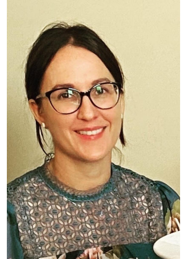
B.App.Sc (Occupational Therapy); AHPRA registered OT; Occupational Therapy Australia Member