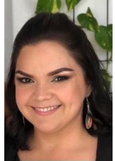
B.App.Sc (Occupational Therapy); AHPRA registered OT; Occupational Therapy Australia Member