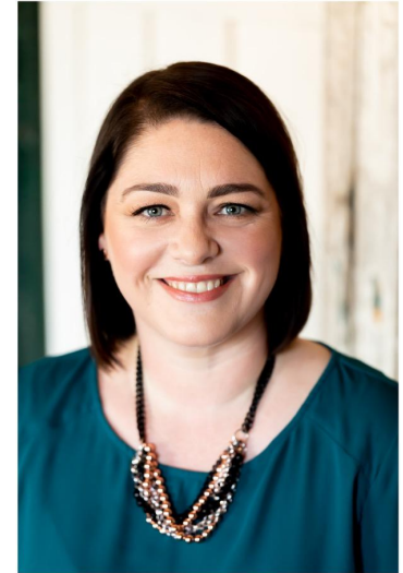
B.App.Sc (Occupational Therapy); AHPRA registered OT; Occupational Therapy Australia Member